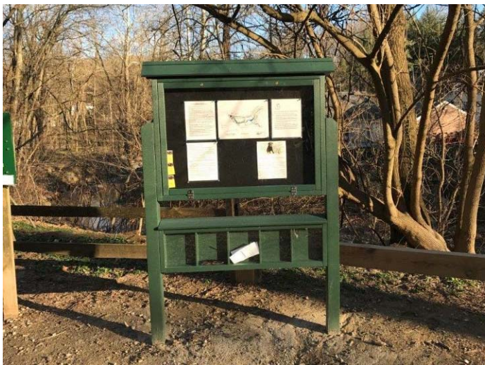
Kiosk as you enter the park.