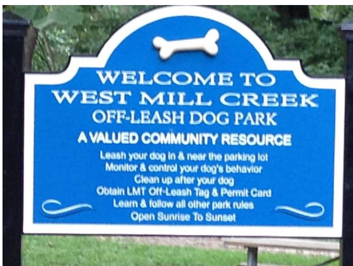
Welcome sign at entrance.