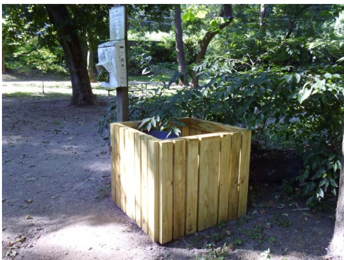
Trash corrals courtesy of the Boy Scouts.